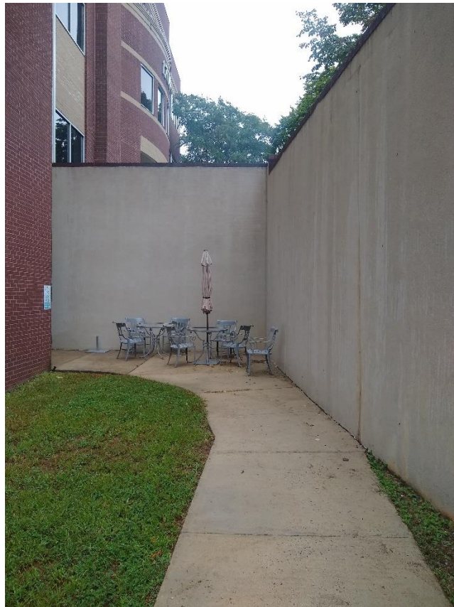
HPDP wall space overview